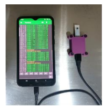
pH device by VeTech